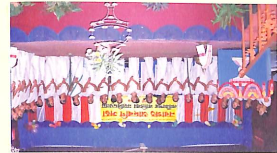
Freshers' Social - 2010