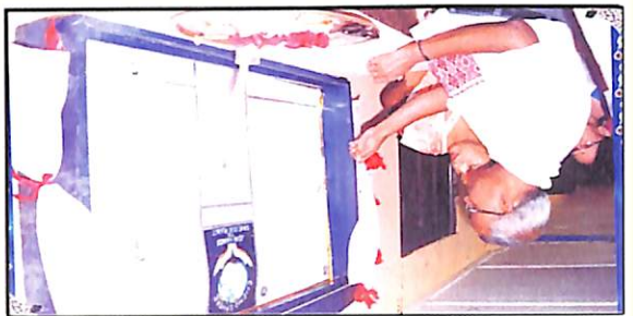
Inauguration of wall magazine of Chemistry Dept.