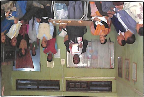
Release of Hostel Magazine