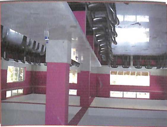
New Hostel Dining Hall