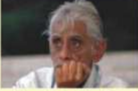
হীৰেণ ভট্টাচাৰ্য, কবি ১৫-১১-২০০৮

আপোনালোকৰ কলেজৰ পৰিবেশ বৰ ভাল লাগিছে। শিক্ষক-শিক্ষয়িত্ৰী সকলৰ লগত কথা পাতি ভাল লাগিল।