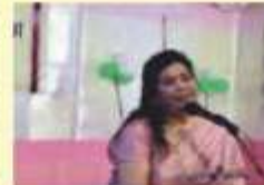
অনুৰূপা শৰ্মা পূজাৰী শীৰ্ষস্থানীয় কথাসিদ্ধী, ৬-৮-২০১৬

লক্ষীমপুৰ বালিকা মহাবিদ্যালয়লৈ এইবাৰ প্ৰথম আহিলো, ভাল লাগিল। ভাল লাগিল সেউজ পৰিবেশ আৰু মহাবিদ্যালয়ৰ 'কব পৰ্কিং'ৰ পৰা আৰম্ভ কৰি ভৱনলৈকে সুন্দৰ-সুসজ্জিত। আজি প্ৰথম আহিছো, অথচ এনে লাগিছে যেন শিক্ষকবৃন্দ আৰু ছাত্ৰী সকলক প্ৰায়ে লগ পাই থাকে। লক্ষীমপুৰৰ বৈশিষ্ট্যই হৈছে অধ্যয়ন আৰু অতিথি পৰায়ণতা। এই কথাৰ প্ৰত্যক্ষ প্ৰমাণ পাই সুখী হ'লো, সন্তোষিত হ'লো। আশা ৰাখিছো এই পৰম্পৰা অব্যাহত থাকিব। শেষত মহাবিদ্যালয়খনৰ সৰ্বাঙ্গীন উন্নতি কামনাৰে-