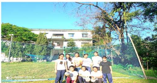
Sepak Takraw team of the college