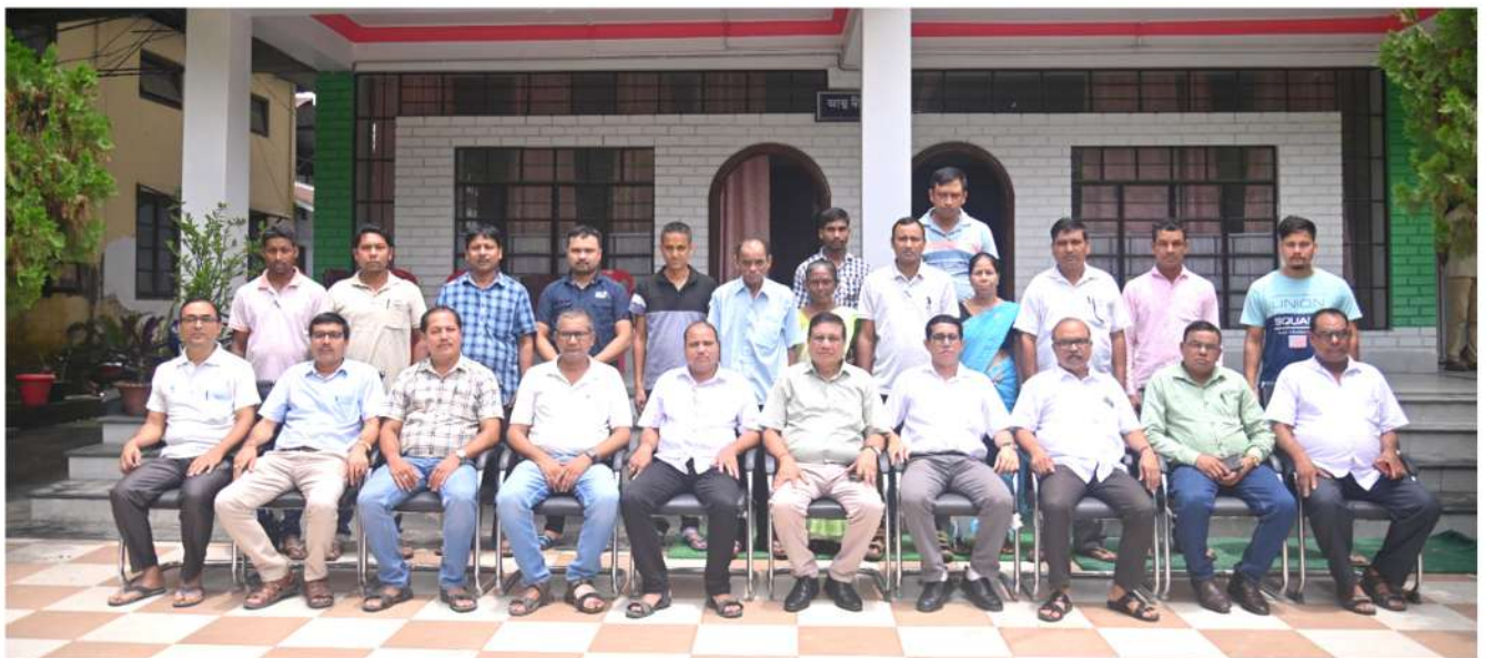
Group photo of Non Teaching staff