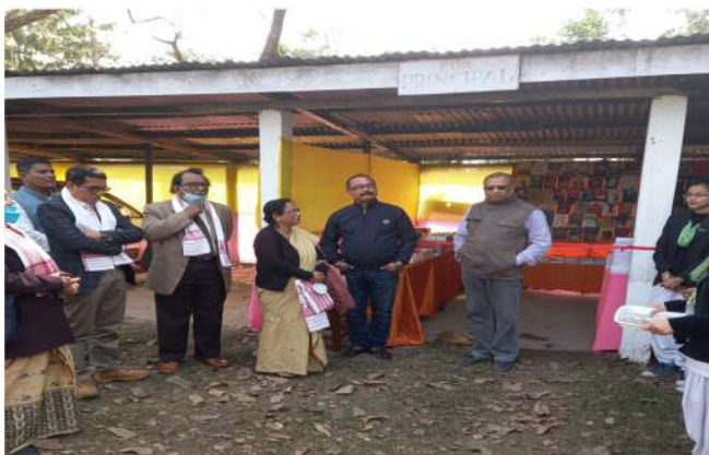
Inauguration of book fair on the occasion of Saraswati Puja.