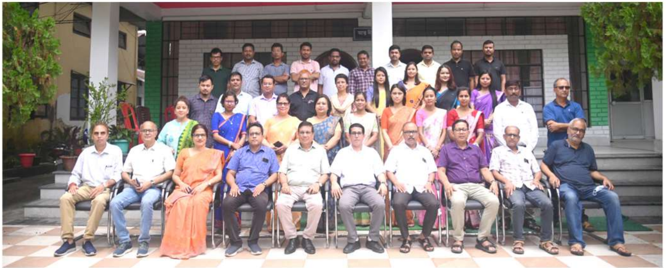
Photo of G.B President, Principal, Vice -Principal with the Faculty Members