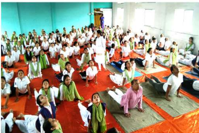
Teachers and Students practicing Yoga on International Yoga Day, 2022