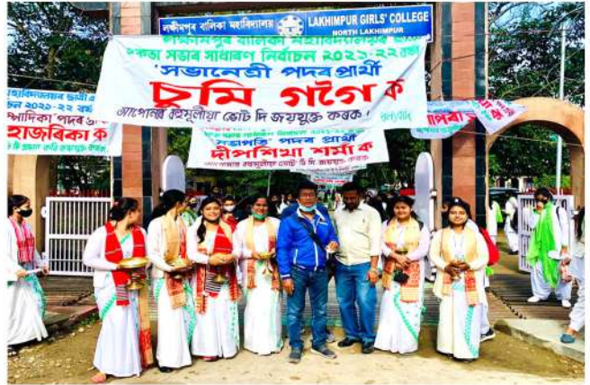
A glimpse of the Students' Union Election, 2021