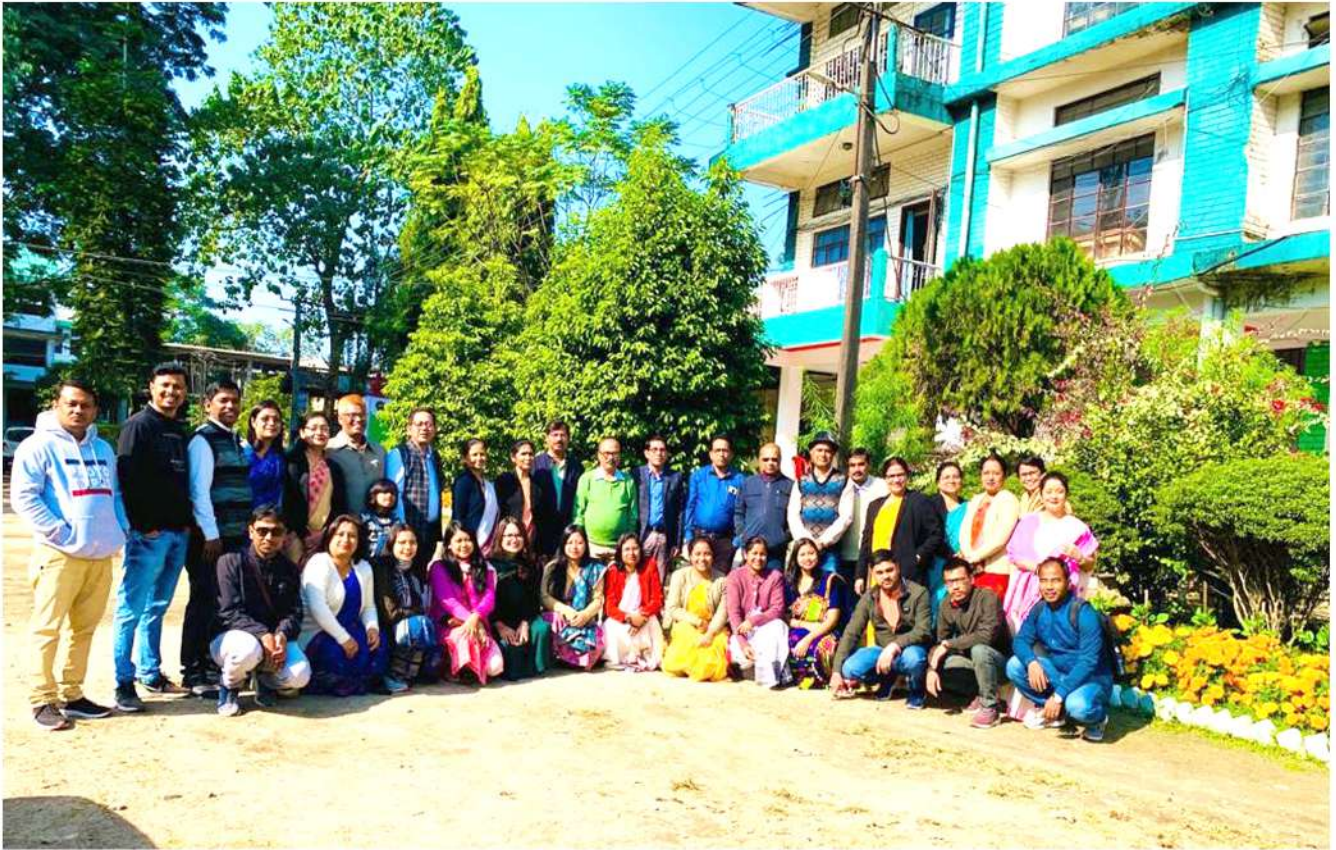
Faculty members of Lakhimpur Girls' College during the celebration of New Year, 2022