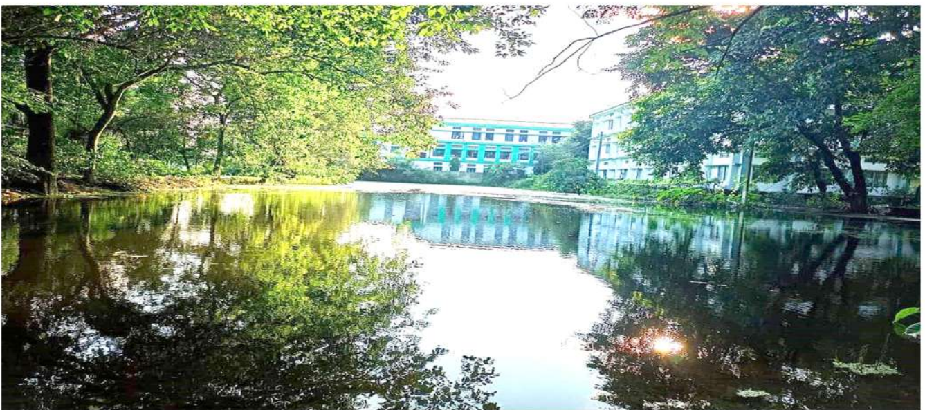
A picturesque view of the college