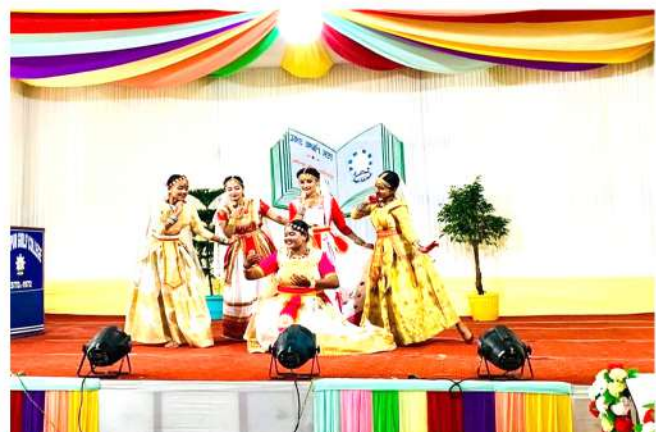
Students performing Satriya during Fresher's, 2022