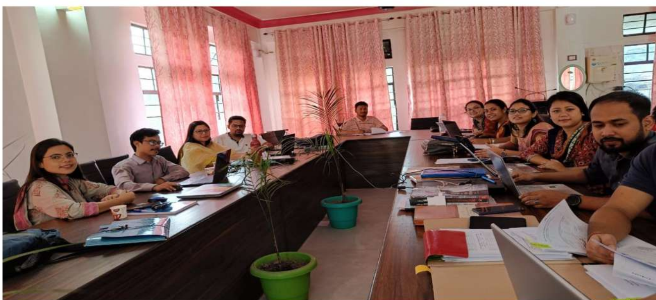
Faculty members during SSR preparation for 3rd cycle of NAAC Assessment