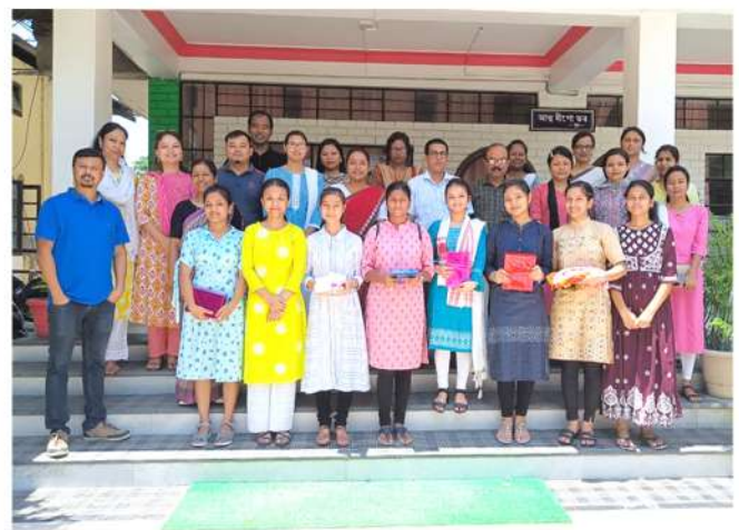
Faculty members and meritorious students of H.S 2nd year, Batch of 2022