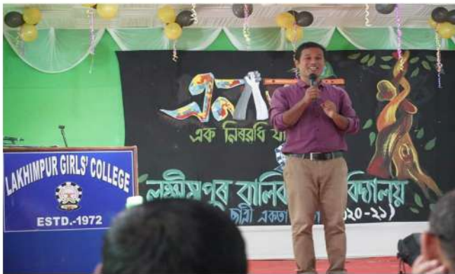
College Freshers, 2021

❖ Saraswati Puja was celebrated on 5th of February, 2022. The puja celebration was accompanied by a book fair in the college campus.