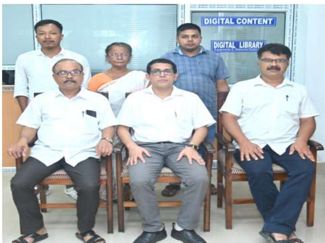
Principal and Vice- Principal with the Library Staffy staff