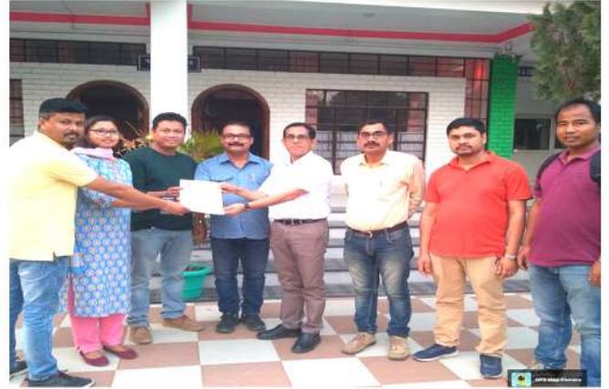
Signing of MoU with Lakhimpur Taekwondo Association