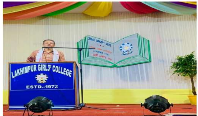
College Freshers, 2022