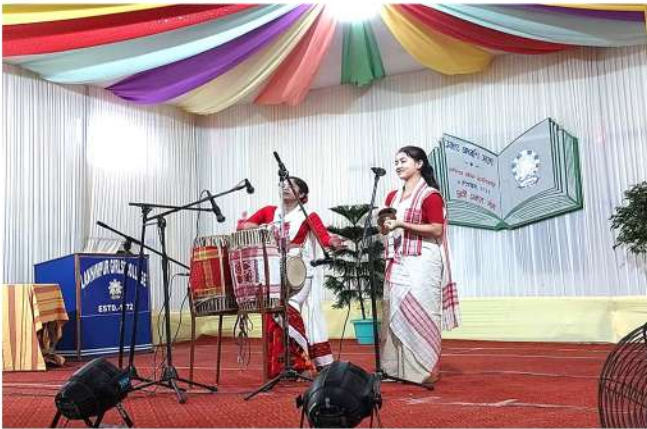
Students performing Dhool-Taal during Freshmen social, 2022