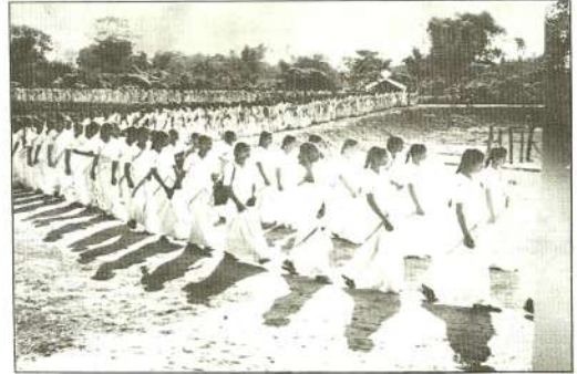
Procession from old College Building to the present one on 8.12.84, the occasion of opening the new building of the college.