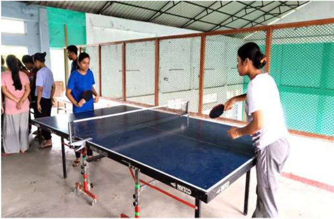
Students playing table tennis during college week, 2022