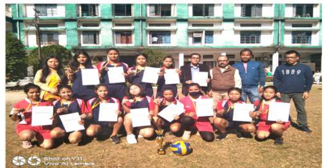
Volleyball team with the winning trophy